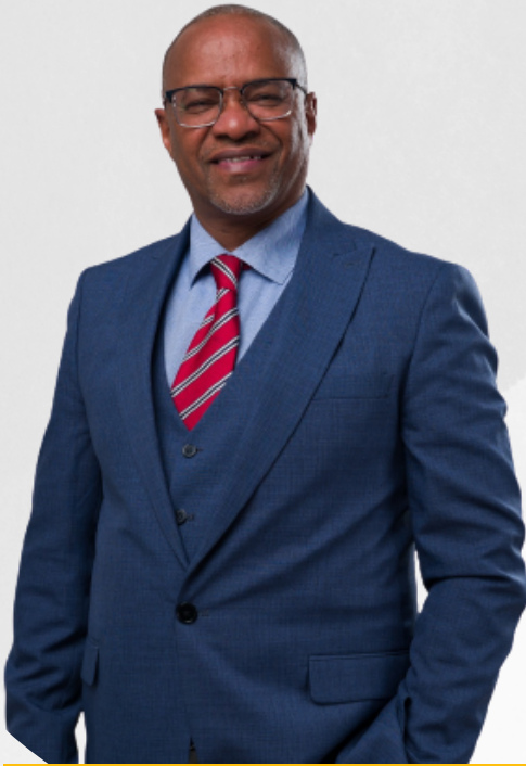
CHIEF GUEST: HON. ZACHARIAH MWANGI

Mr. Zachariah Mwangi Njeru is the Cabinet Secretary for Lands, Public Works, Housing, and Urban Development in Kenya. Under his docket are three (3) state departments with mandates on Lands and Physical Planning, Public Works, and Housing and Urban Development.